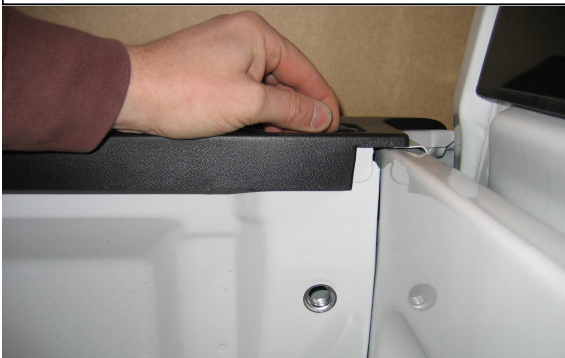
LOWER BRACKET UNTILL THE NUT IN THE BRACKET LINES UP WITH THE EXISTING HOLE ON THE INSIDE OF THE TRUCK.