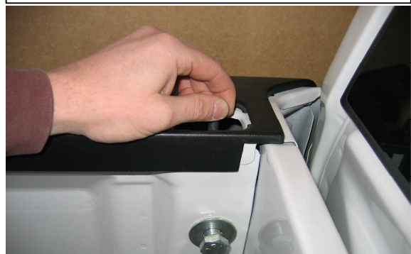
USING 5/8" X 1" BOLT, NUT, LOCKWASHER & FLATWASHER, HAND TIGHTEN BOLT THROUGH THE EXISTING HOLE INTO THE BRACKET.