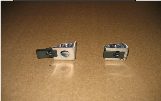
ATTACH CLIP NUTS TO ALUMINUM STAKE POCKET BRACKETS