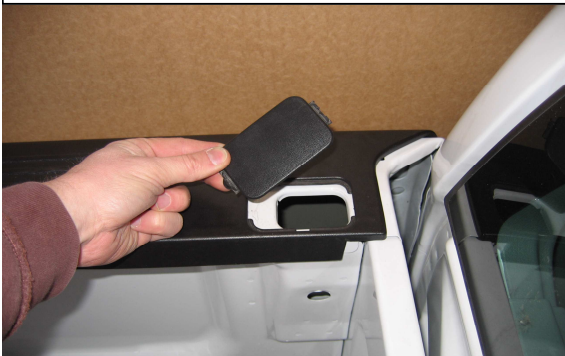
CHECK THE FRONT STAKE POCKET ACCESS, IF COVERED, REMOVE ACCESS PANNEL