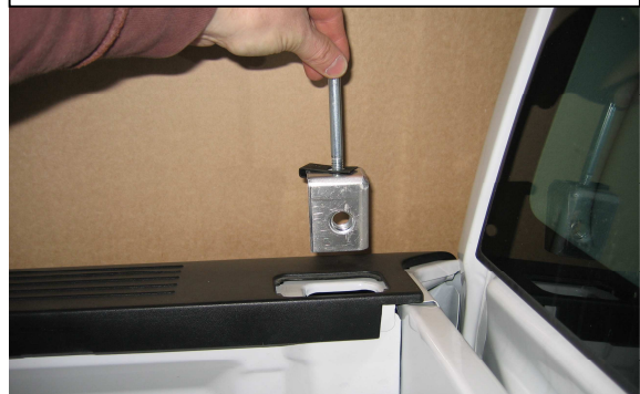
HAND THREAD 3/8" X 4" BOLT INTO STAKE POCKET BRACKET & LOWER INTO STAKE HOLE AS SHOWN.