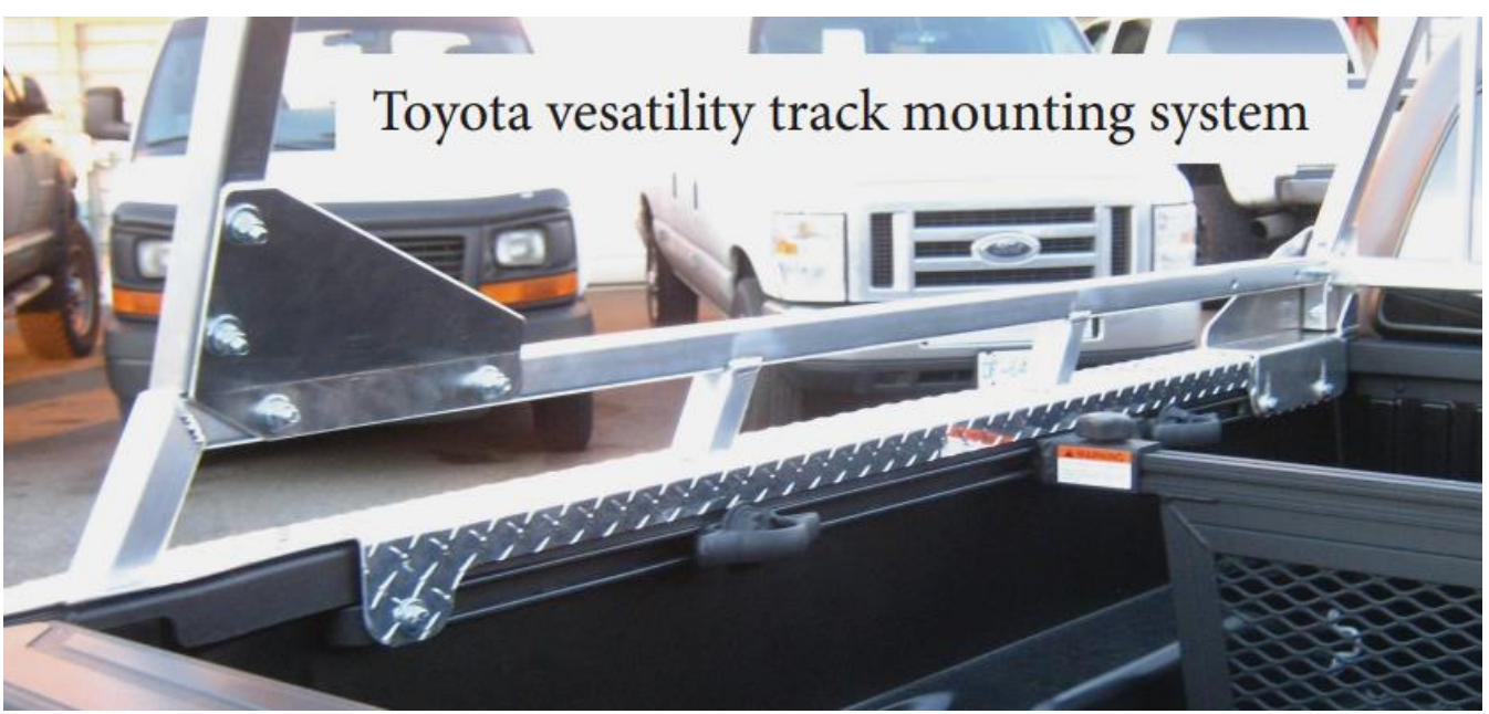
Toyota versatility track mounting system